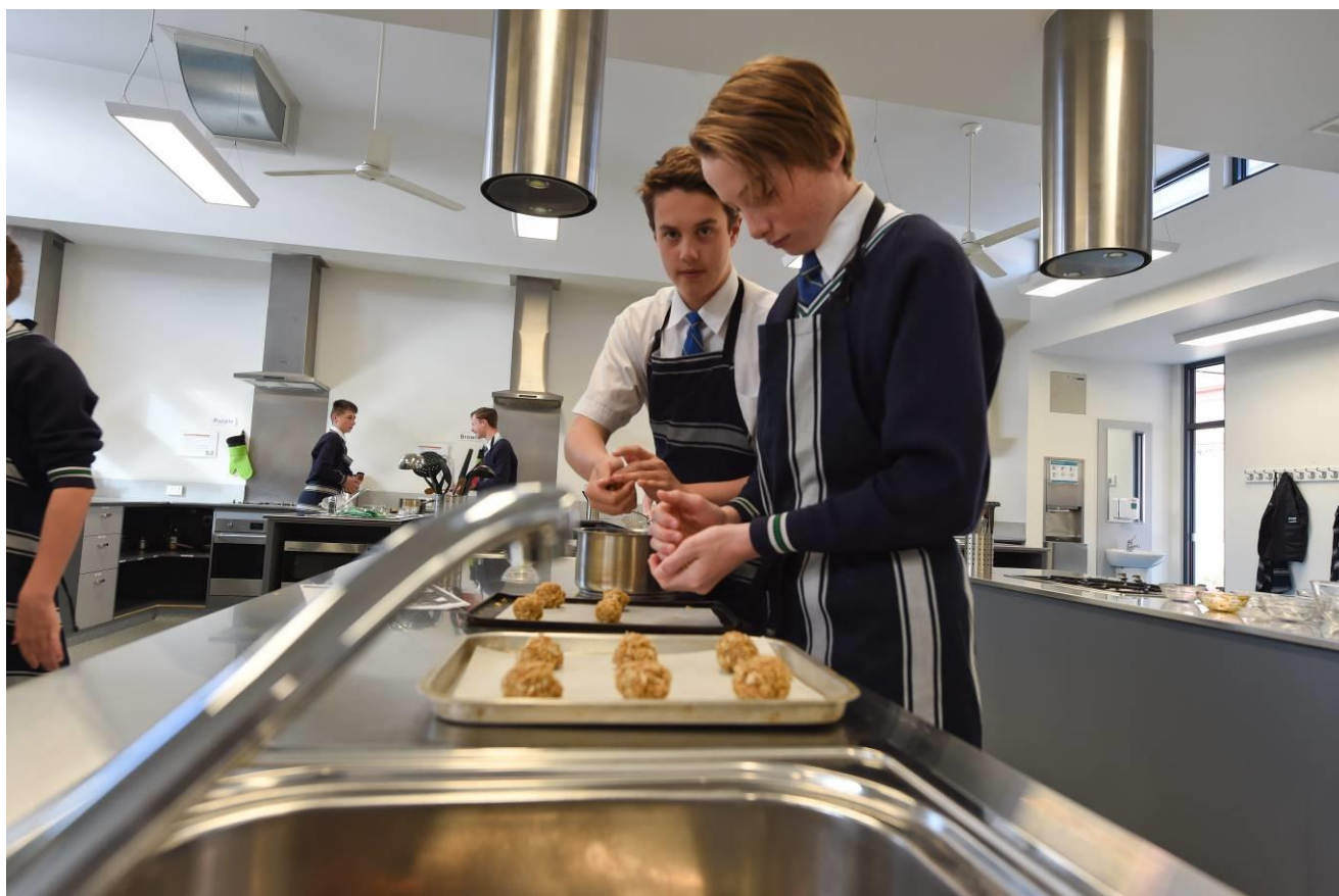
Whelan Food Technology Centre

Please check the College website for further details of the current Senior School programs - https://www.stpats.vic.edu.au/students-parents-staff/curriculum/senior-school/