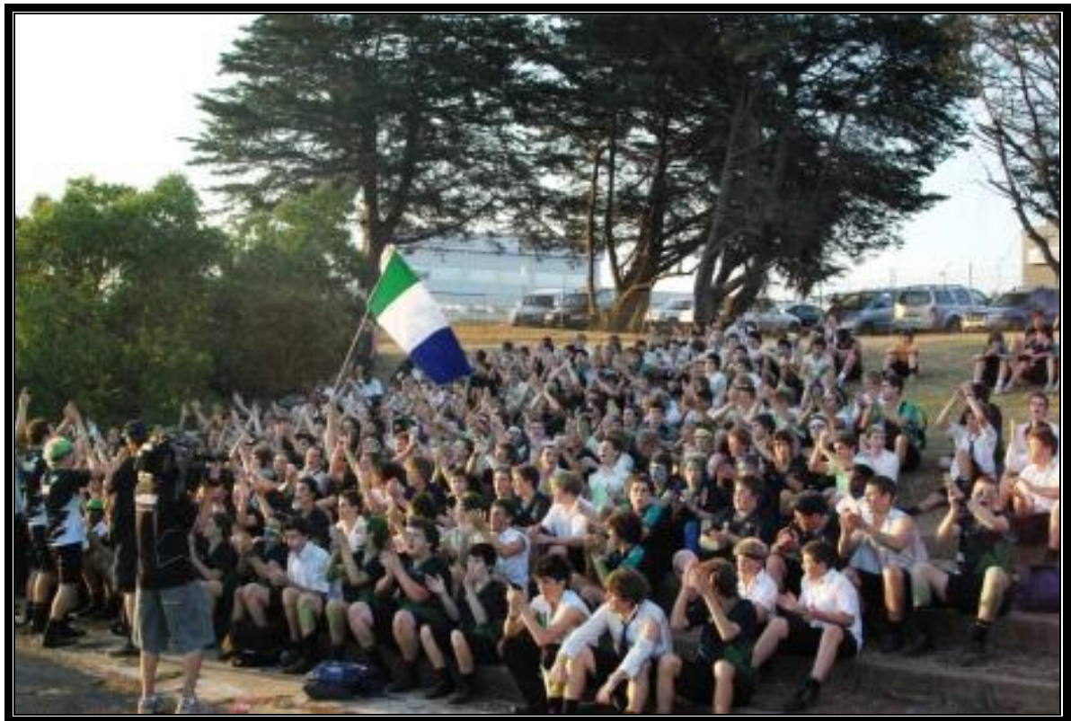
The St Patrick's College Cheer Squad!