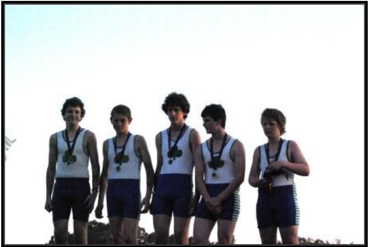
Head of the Lake Regatta held at the Barwon River Geelong