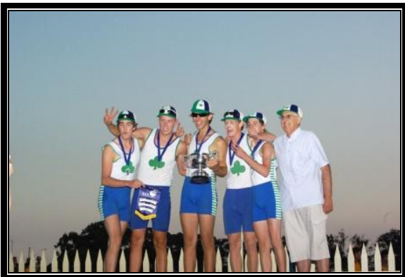
The 1 st IV with the Harold Deveson Cup