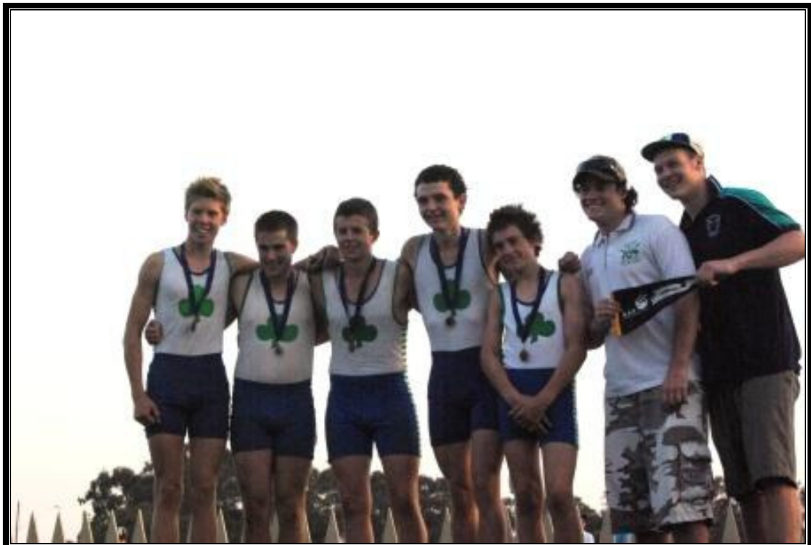
Head of the Lake Regatta