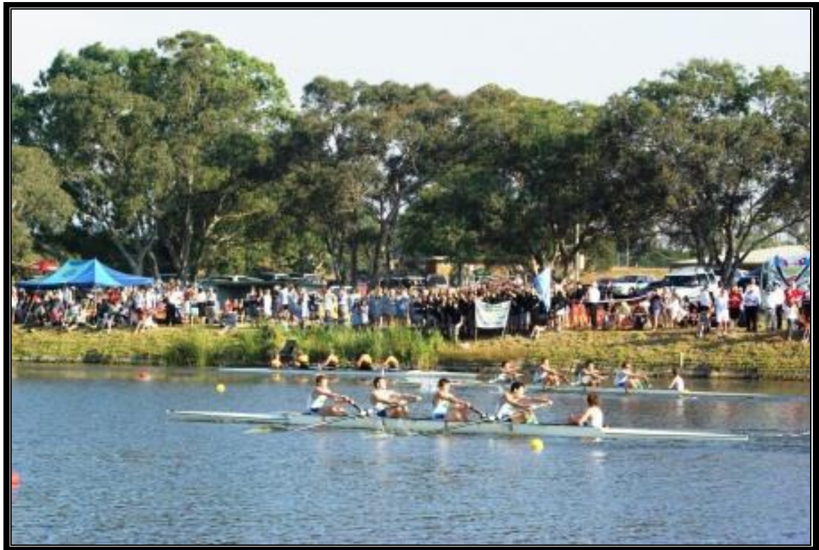
Head of the Lake Regatta