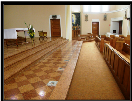
St Patrick's College Chapel Restoration