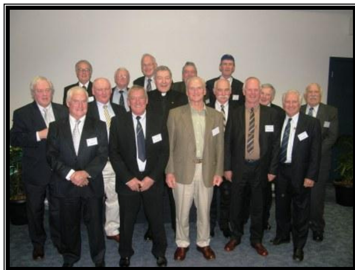
Attendees of the Class of 1959 Reunion held on Saturday August 1